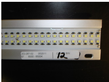
LED Array Bin Label

The fixture bin label will be located on the rear side of the LED housing fixture.