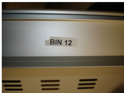
Fixture Bin Label

The panel bin label will be located on the front face of the cove panel or the front face of the speaker panel depending