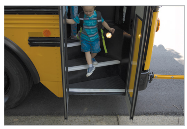
The #1 OEM preferred stair tread