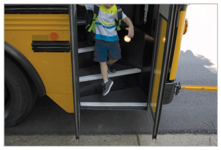
The black tread with white nosing is the most popular color option with OEMs