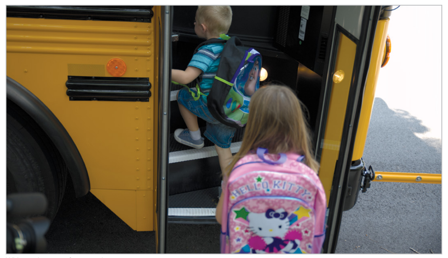
Withstands years of wear and tear