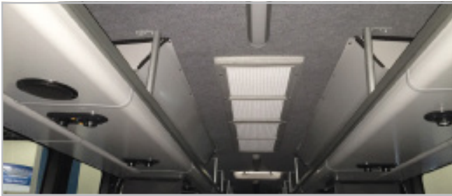
Non-Ducted Deluxe OPR (Typical Non Ducted End Cap)

Systems include front hand rail, OPR pans, hanger brackets, hanger covers, false floor and carpet (if applicable) and all hardware except for the fastening to the bus.