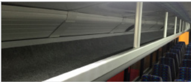
Ducted Deluxe OPR (Typical Ducted End Cap)