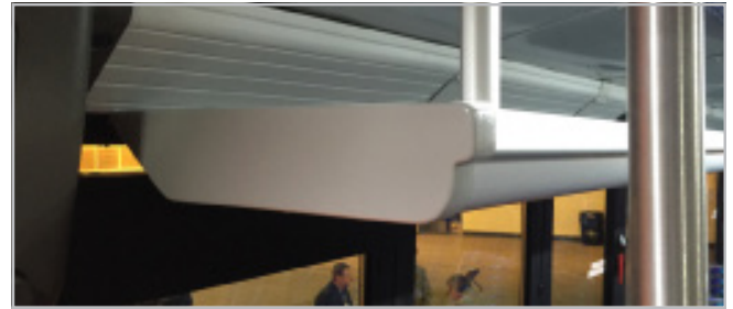
Non-Ducted Deluxe OPR (Carpeted False Floor)