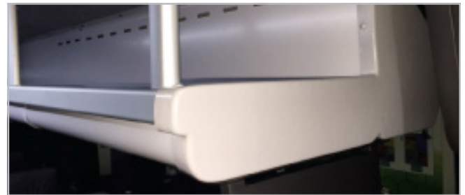
Ducted OPR (Dual Reading Lights / Adjustable Air Vents)