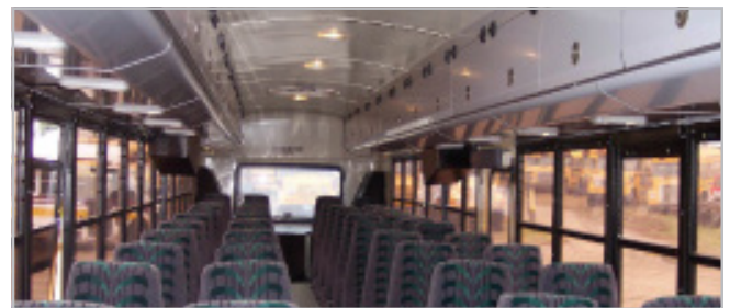
Non Ducted Standard OPR