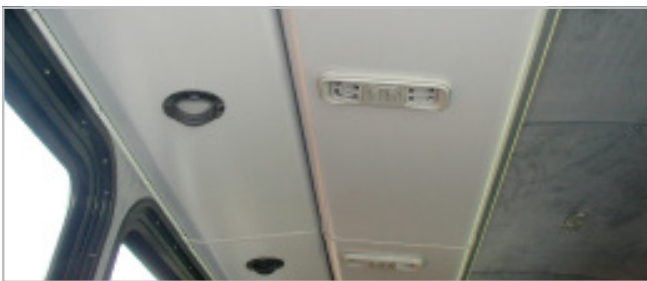
Non Ducted Deluxe OPR with Doors (Dual Reading Lights)