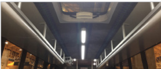
Ducted Standard OPR with Carpeted AC Transitions