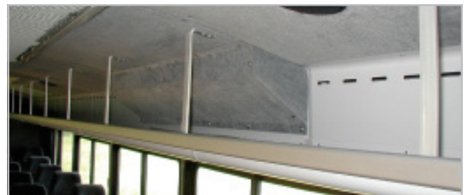
Ducted Deluxe OPR with AC Transitions (Dual LED Reading Lights/Speakers)

1244-Overhead-Parcel-Systems-BR-TR-091521