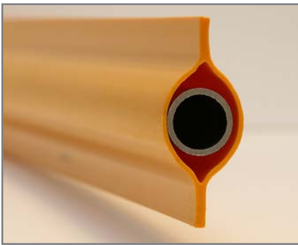
Poly rod has full metal insert for increased durability and strength