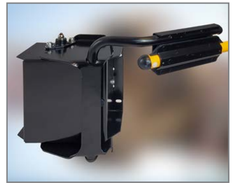
Upgraded hinge arm and driver for longer life