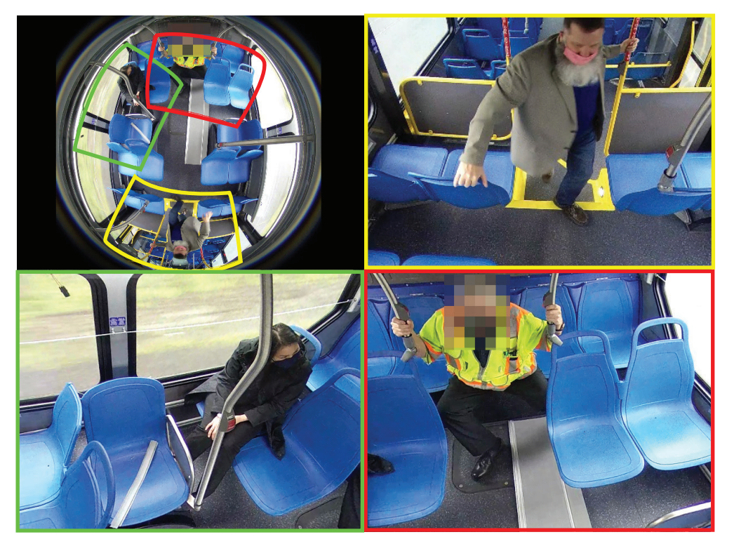
PTZ (Pan Tilt Zoom) View from Rear 360° Placement (Ceiling). Easily redact footage as necessary with Safe Fleet Evidence Manager.

Using PTZ (Pan, Tilt, Zoom) mode, you can select up to three different dewarped views which are displayed in separate quadrants during playback.