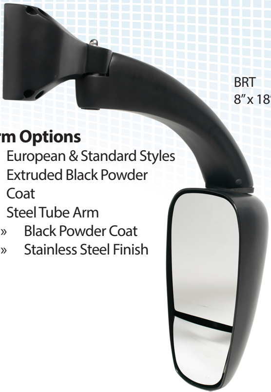
BRT 8” x 18”