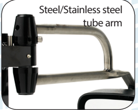
Steel/Stainless steel tube arm