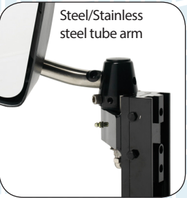
Steel/Stainless steel tube arm