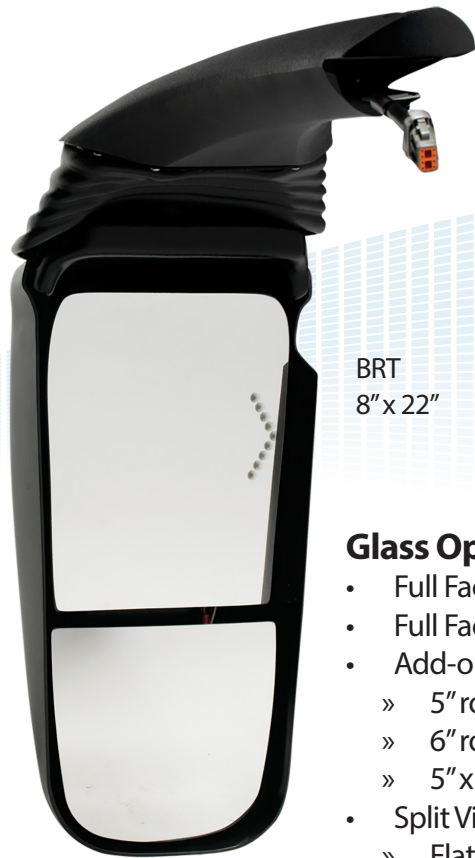
BRT 8” x 22”