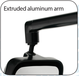
Extruded aluminum arm