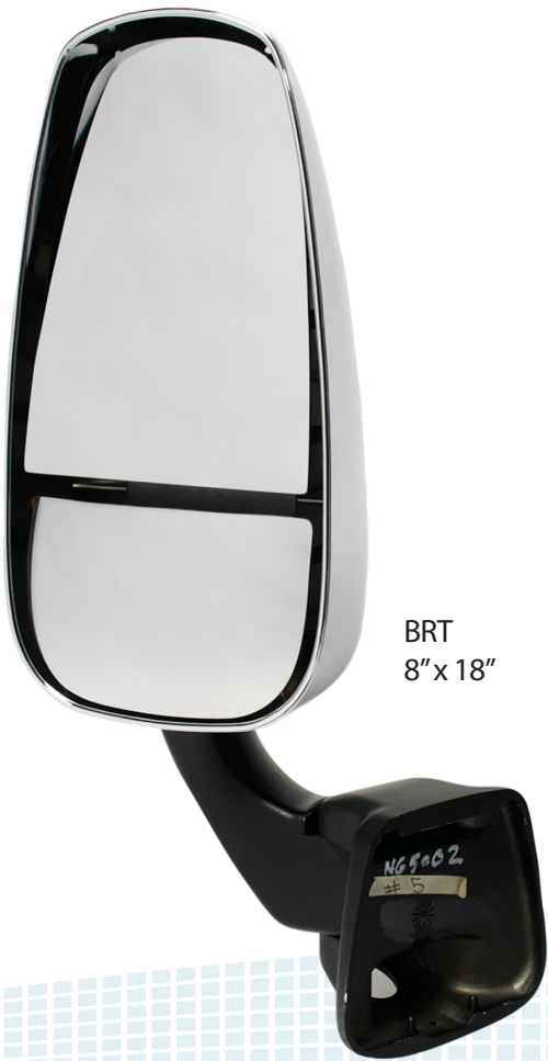
BRT 8” x 18”