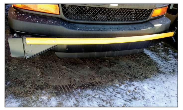
Available as bumper mount