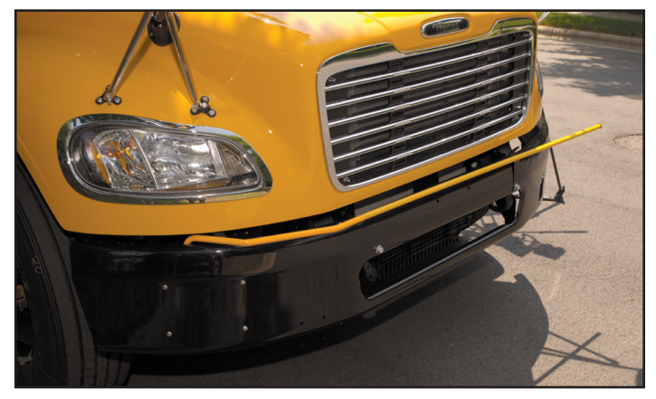
Available as fully integrated into bumper

13501 S Ridge Dr. • Charlotte, NC 28273 • Tel: 800 . 951 . 7867 • Fax: 704 . 889 . 2760 • sales@smiglobal.net W W W . S M I G L O B A L . N E T NCL-7.2-6004 | Rev A | 1-29-15 | ISO 9001 Certified