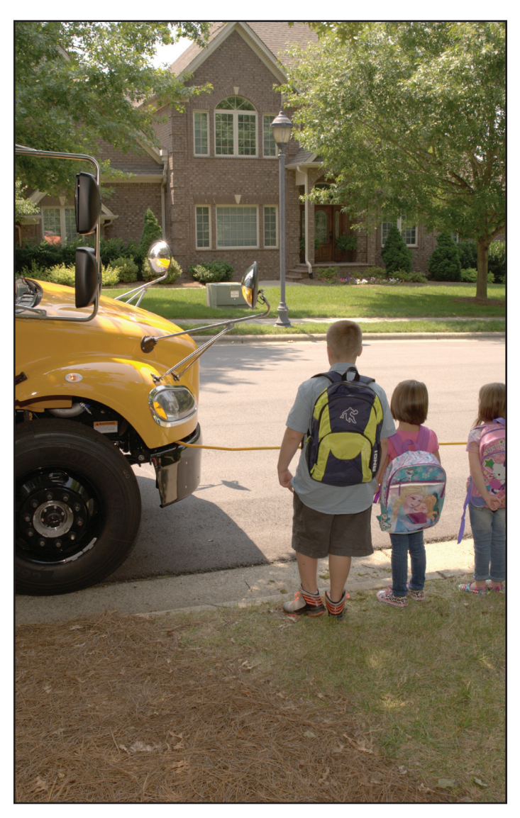
Improves driver visibility to even the smallest of passengers