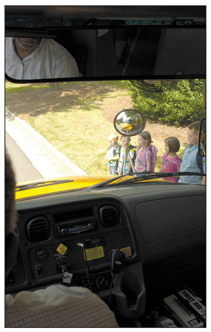
Driver's perspective - The child at the end is 3.5' tall and clearly visible.