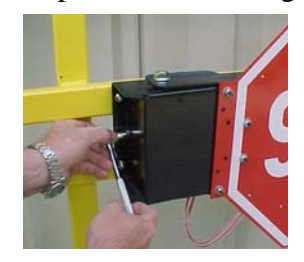
Remove screws from both ends of the cover