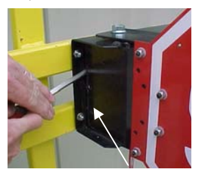
3. Remove the cover by using a flat bladed screwdriver to pry it off.