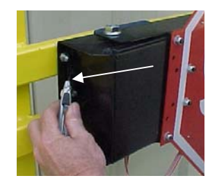
1. Using a utility knife, cut the silicone seal on both ends of the stop arm cover. using 5/16" socket

Replacement is as follows: (Pictures shown are for representative purposes only. Procedure is the same for either 5-series or 6-series- Stop Arm or Crossing Arm.)