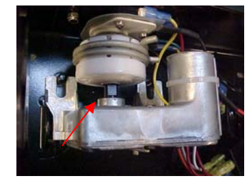
6. Position flats of motor shaft so that they are parallel to the base, for ease of assembly- then push into place as shown above. Reattach (2) each of washers, lock-washers and nuts to secure new motor in place.