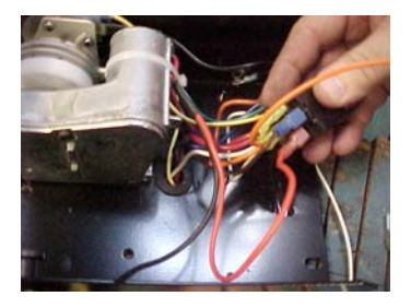
7. Reattach the red and black motor wires to the relavs (or to module- if 6-series). The red wire attaches to the upper relay, the black to the lower.