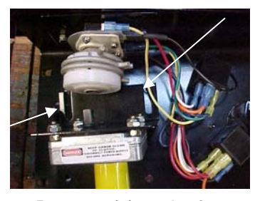
5. Remove (2) each of washers, lock-washers and nuts on the motor bracket and remove both the motor and bracket from the assembly, using a 7/16" socket