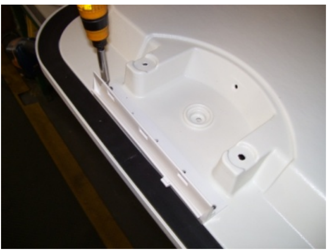
STEP 8 . Using the same screws, attach the new handle base to the lid.