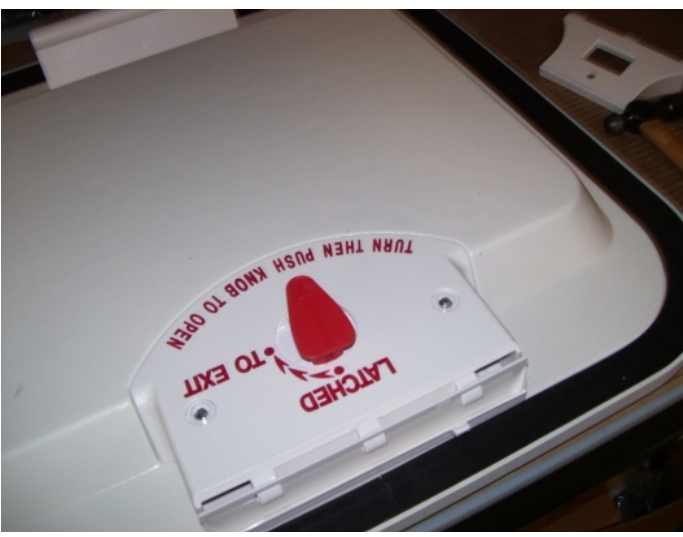
STEP 14. Holding the outer knob in the Step 13 orientation, thread the inner knob onto the shaft for a total of 8.5 rotations.