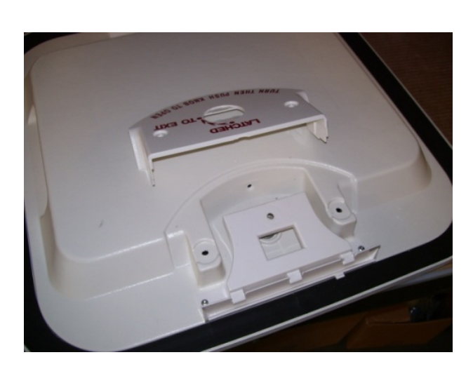
STEP 5 . Remove the handle shield.