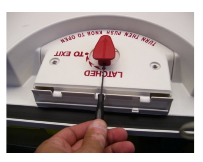
STEP 2. Orient the inner red knob as shown. Remove set screw in knob using 5/32" allen wrench.