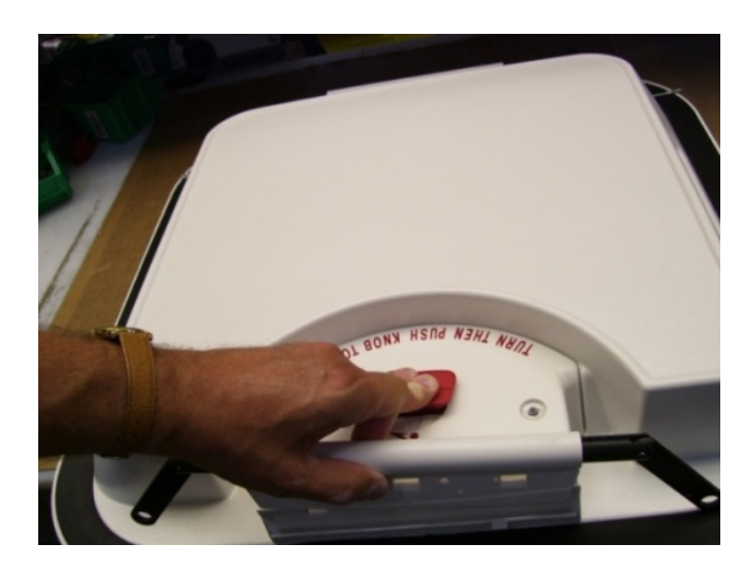
STEP 1. Remove the lid from the hatch frame (T-40 Torx drive). Place lid on a flat surface with the inside of the lid facing upward. Depress the inside red knob to remove release hinge.

Electric Drill w/ 5/32" drill bit Hammer