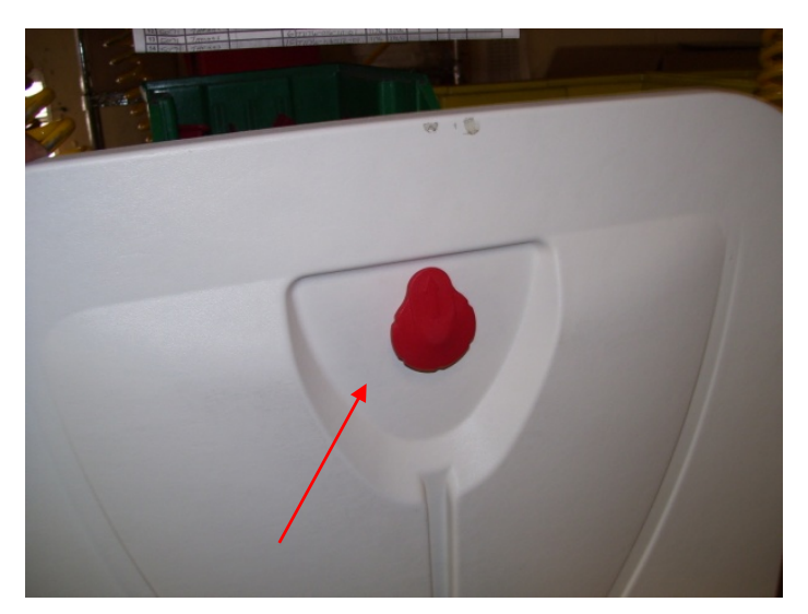
STEP 13. Orient the lid vertically as shown. Insert the shaft of the outer knob into the lid with the knob oriented as shown.