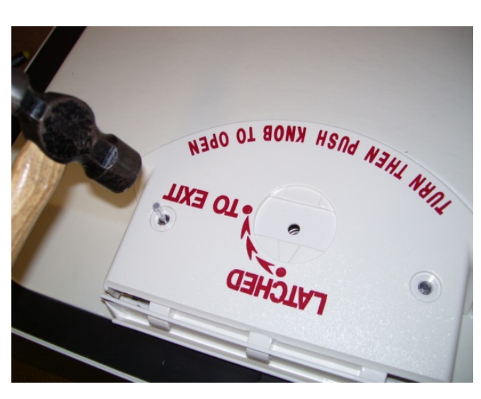
STEP 12. Hold the handle shield down against the lid. Insert the rivets into the holes in the shield and the holes in the lid. Lightly tap on the head of the rivets to set the rivets.