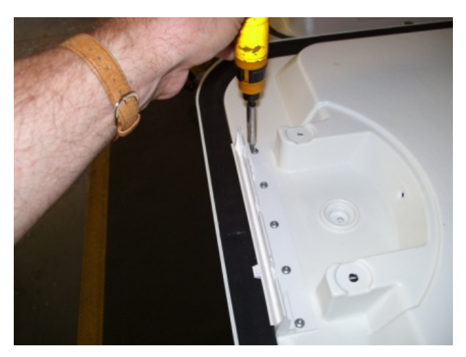
STEP 7. Using a T-20 Torx bit, remove the 5 screws that hold the handle base to the lid.