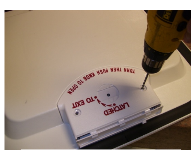
STEP 4. Using a 5/32" drill bit, carefully drill through the center of the plastic rivet. Remove both rivets. Rev 1, 10-20-08