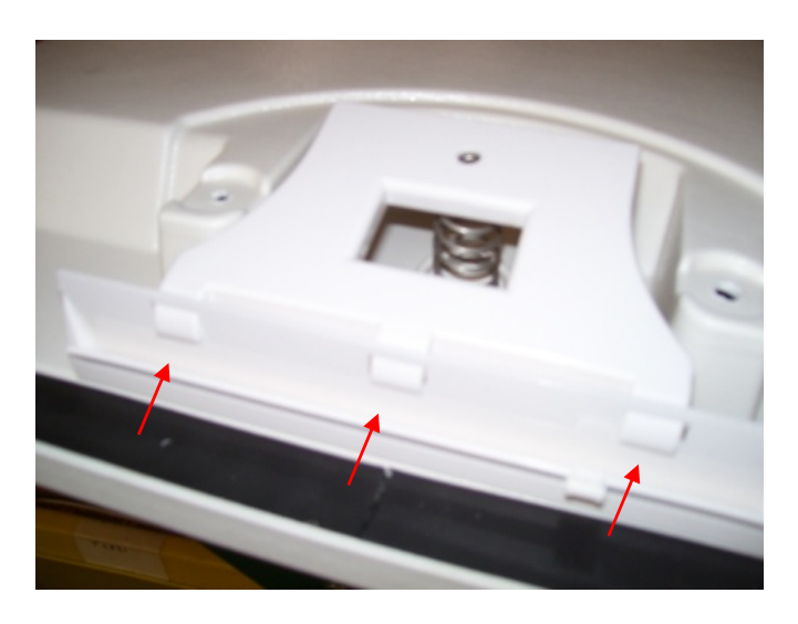
STEP 9. Place the new handle/spring on the lid. Ensure that the handle hooks are in the openings of the handle base (3 places).