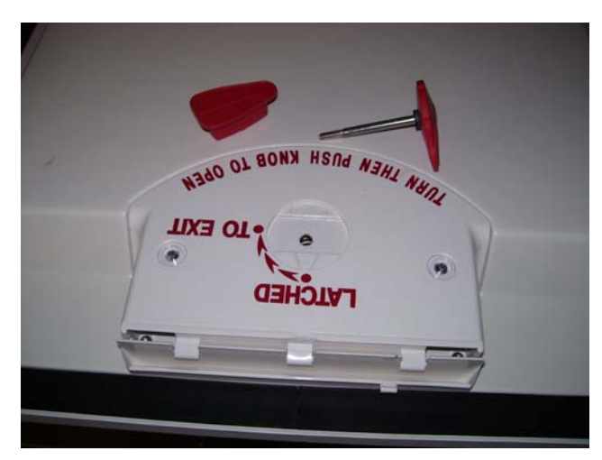
STEP 3. Unscrew the inner red knob from the outer red knob. Remove each from the lid.