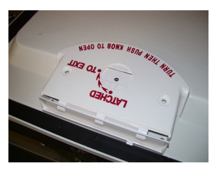
STEP 11 . Place the handle shield back in position.