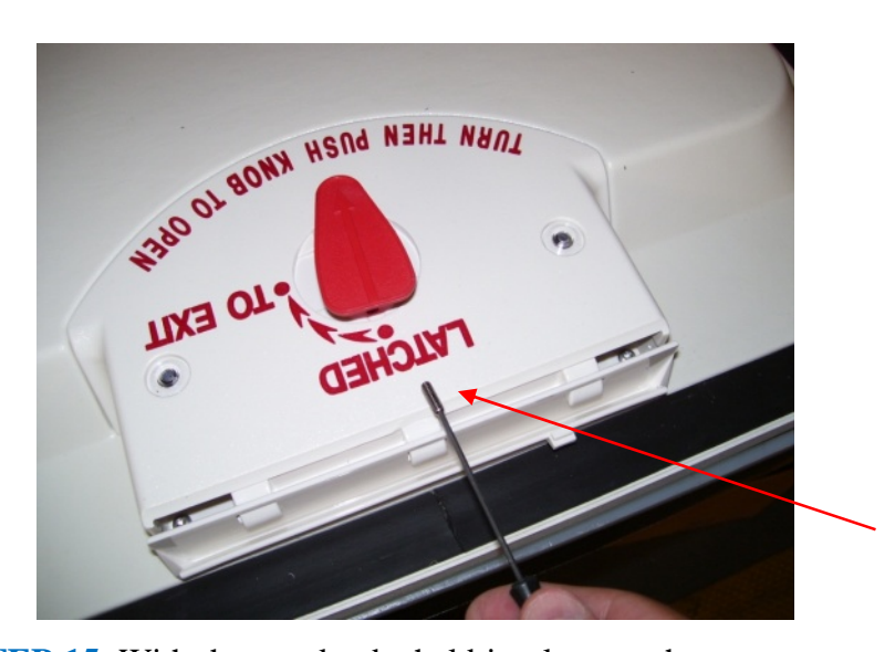
STEP 15 . With the two knobs held in place as shown, secure the set screw in the inner knob. After tightening the set screw, rotate the knobs 180° until the inner knob's arrow points to "LATCHED".