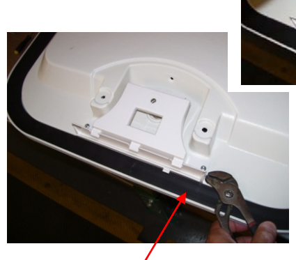
STEP 6 . Remove the hinge pin from the side of the handle base. Pushing on the handle makes it easier to remove the pin. Caution: gloves are recommended for this step as plastic edges can be sharp.